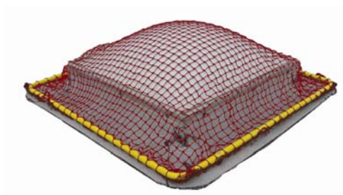
AES Raptor SKYNET System

The AES Raptor SKYNET™ is designed to provide fall protection for workers on a roof with skylights.