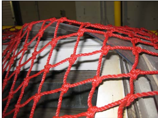
SKYNET over shattered skylight after drop